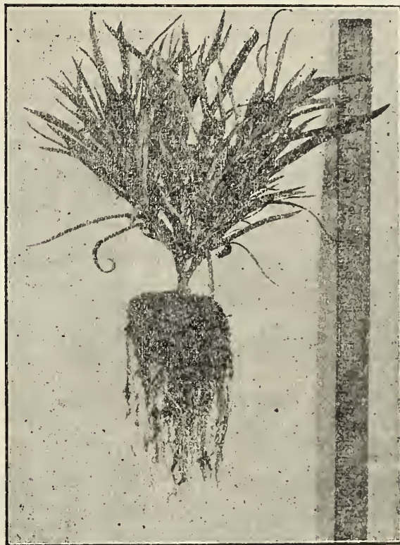
Strong well-rooted Carnation plants like this are scarce and the demand is unusually heavy. Our stock will go rapidly. Orders will be filled in rotation as received. Better get yours in early. For prices see top of page.